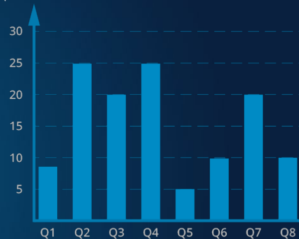
Number of SKUs in production PRODUCTION LEVELS BEFORE GMPS GO LIVE